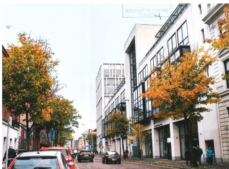
Above: View southwards on Victoria Street