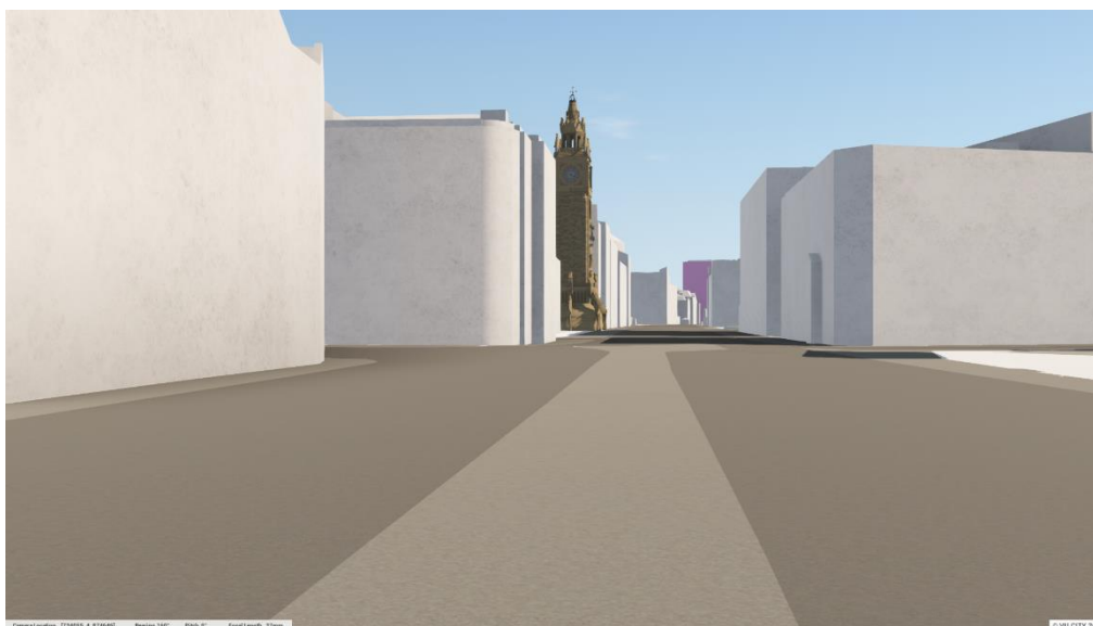
Below: View from Victoria Street