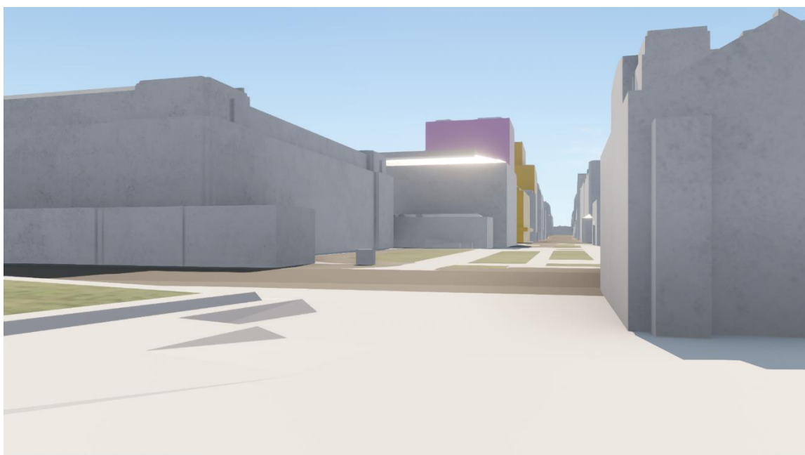
Above: View from Oxford Street